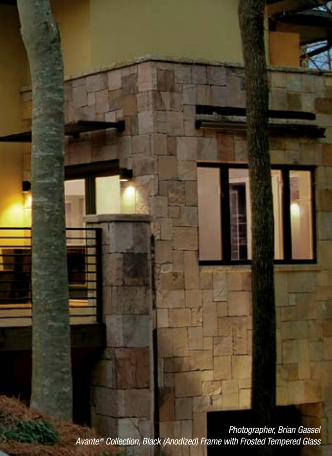
Avante® Collection, Black (Anodized) Frame with Frosted Tempered Glass