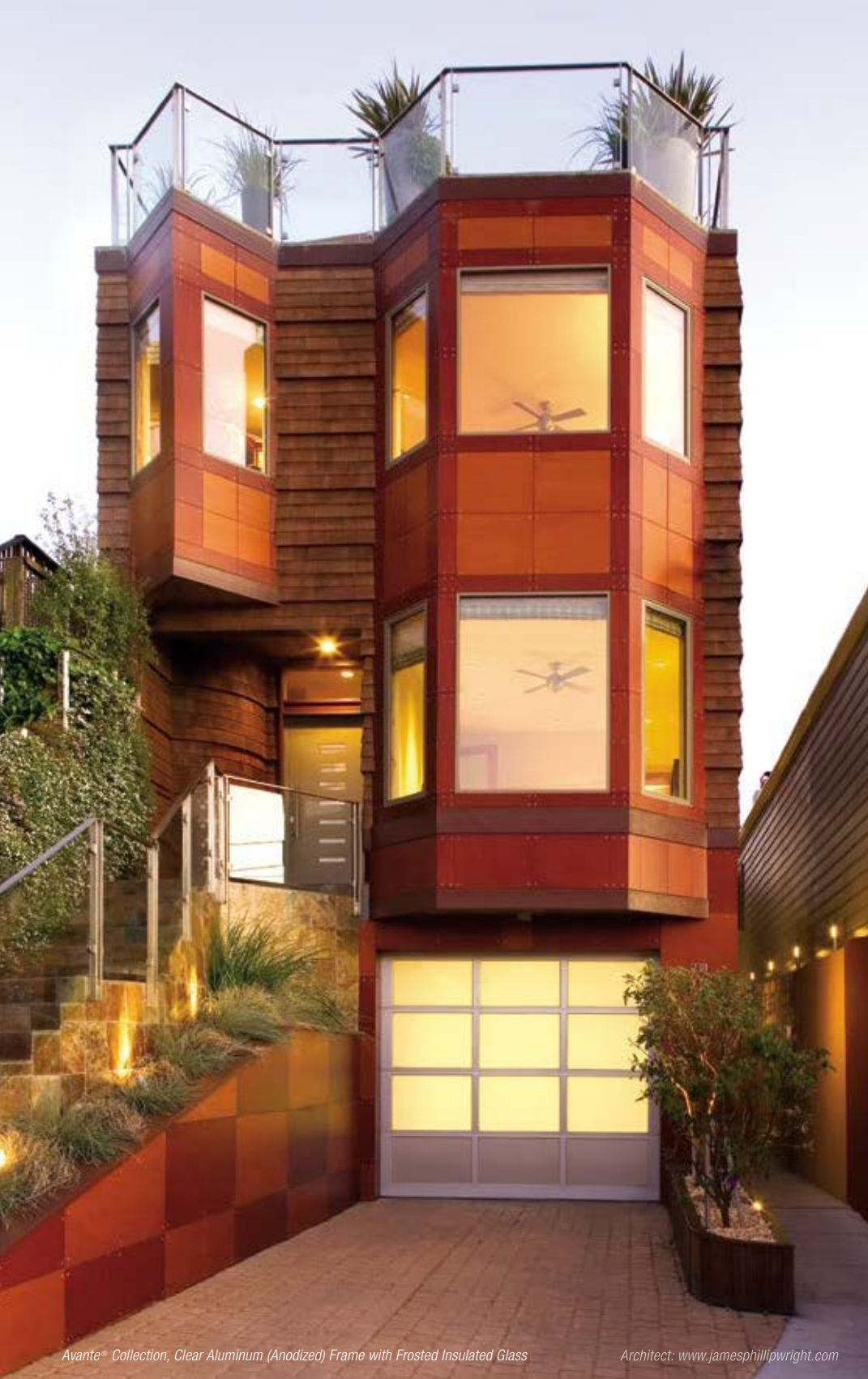
Avante® Collection, Clear Aluminum (Anodized) Frame with Frosted Insulated Glass