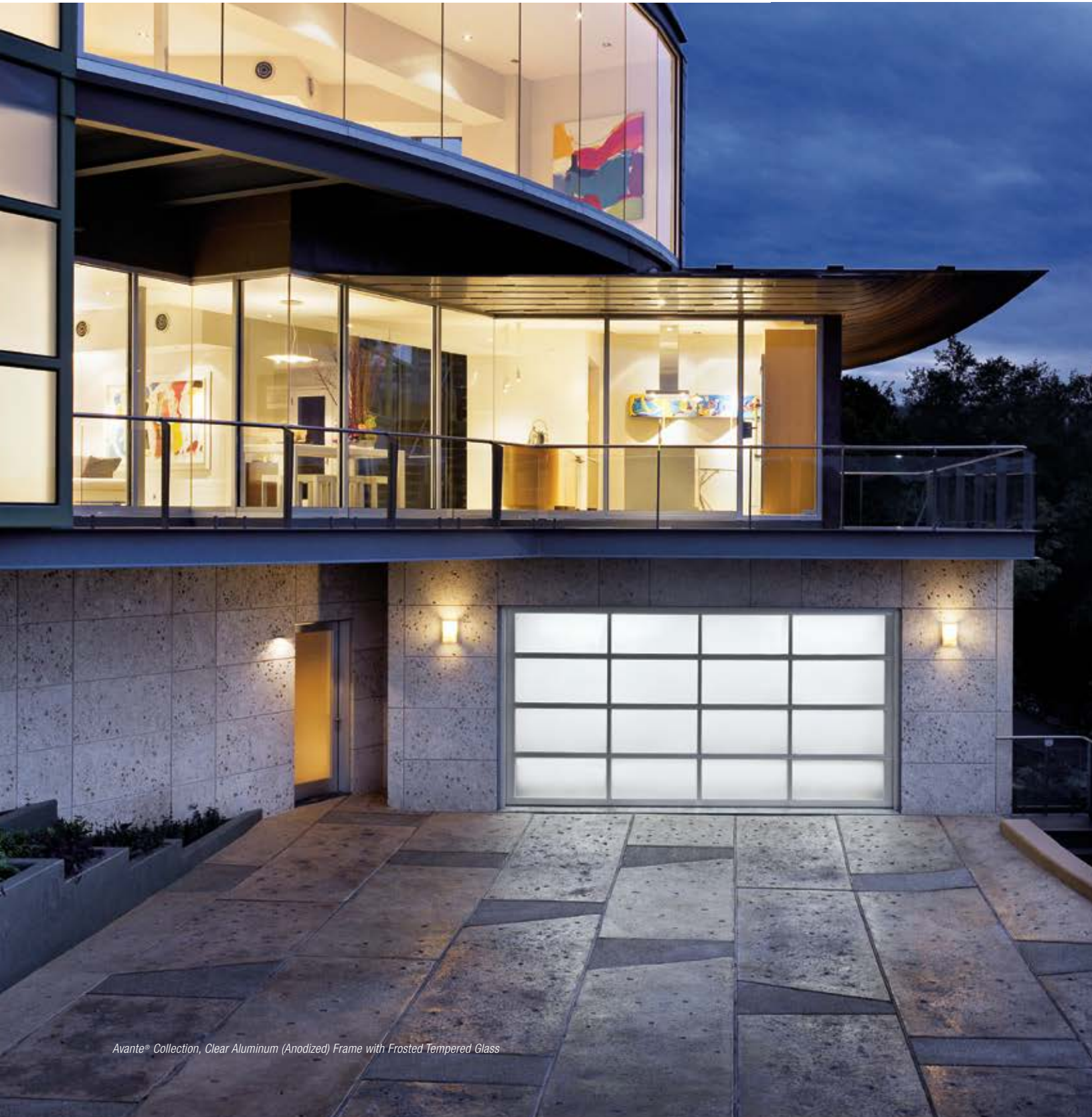
Avante® Collection, Clear Aluminum (Anodized) Frame with Frosted Tempered Glass