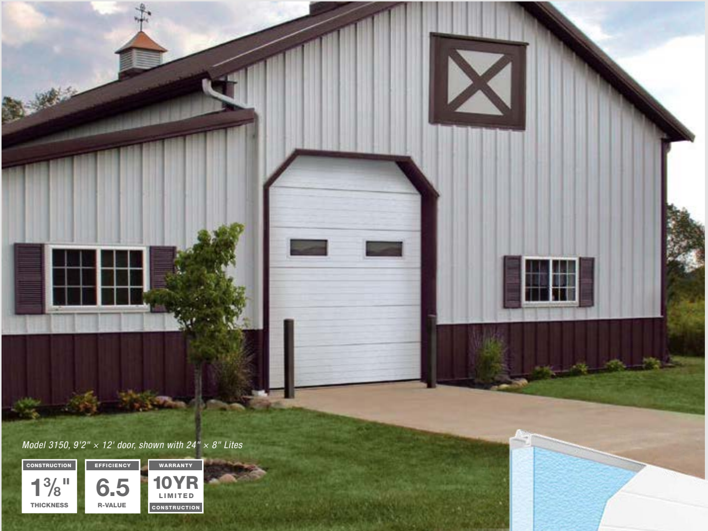
Model 3150, 9'2" x 12' door, shown with 24" x 8" Lites