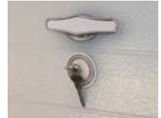
Outside keyed lock